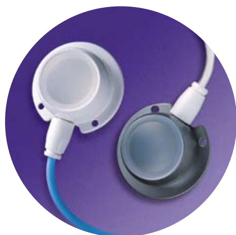
Vaxcel Standard Implantable Ports