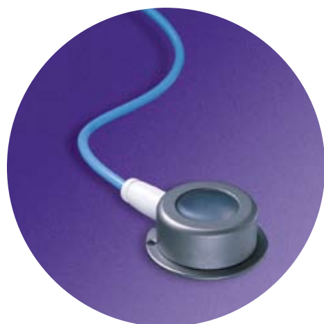
Vaxcel Mini Implantable Port

Septum is designed to provide a target area larger than conventional ports to facilitate access